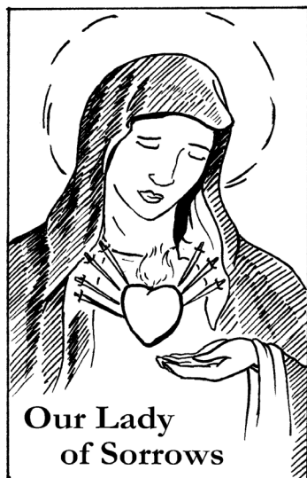
Our Lady of Sorrows September 15th

The Retreat Dates: October 2, 3, 4 at the Spirituality Center in Frazer, PA. Call 215-906-6337 or 610-399-0890 for more information or to register. All contacts are confidential. National website: www.rachelsvineyard.org .