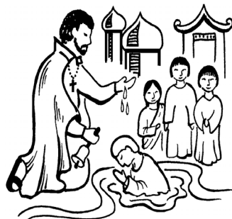
St. Francis Xavier