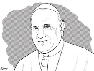
Feast of St. Pope John XXIII Tuesday, October 11