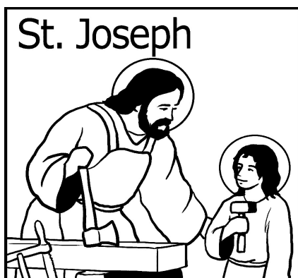
St. Joseph, Spouse of Mary