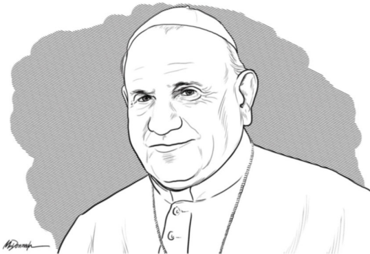
Feast of St. Pope John XXIII Wednesday, October 11