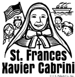
ST FRANCIS XAVIER CABRINI Monday, November 13

For more information and a complete schedule, e-mail vuhungerweek@gmail.com .