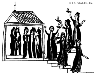
The Groom is here! Come out and greet him!

You may also respond by leaving your name and the number attending in the box marked Thanksgiving Dinner on the table on the back left side of the church. All responses must be in by Monday, November 13 at the very latest.